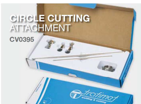
SPARE PARTS NOT INCLUDED